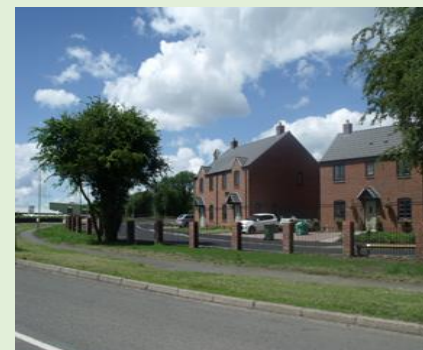
Land at Snedshill – completed NuPlace