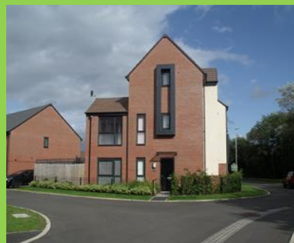
Frome Way – completed Keepmoat Homes