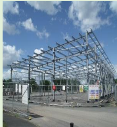
Hadley Park B Eurogarages – started on site (site sold in 17/18)