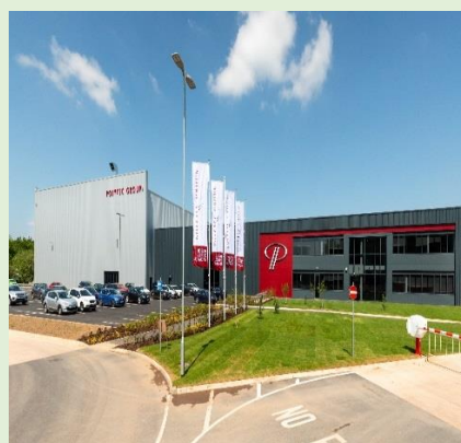
T54 – Plot 2 Polytech - Operational