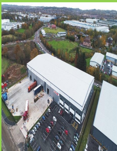
HWW – Plot 9 Rosewood – Operational