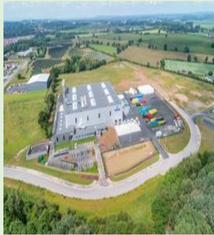
HWW – Plot 2a Kensa Creative - Operational