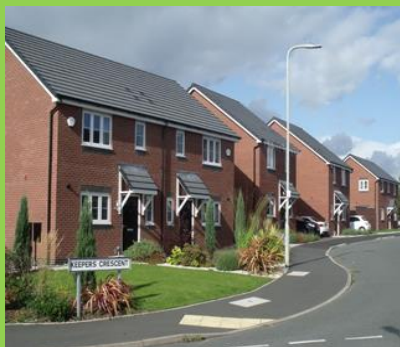
Daisy Bank – completed Lioncourt Homes