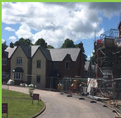
Apley – on site Kier