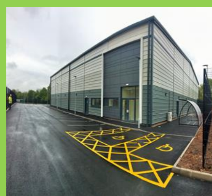
T54 – Plot 5 TWC starter unit - complete