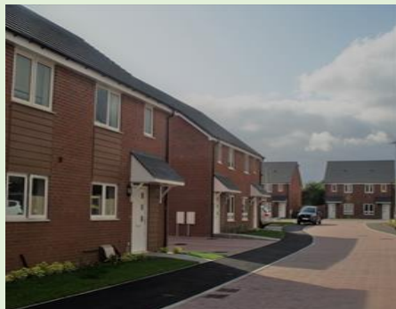
Priorslee D3 – completed Central and Country Developments