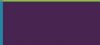
Hortonwood West: 1,921 sqm (20,677 sqft) manufacturing plant