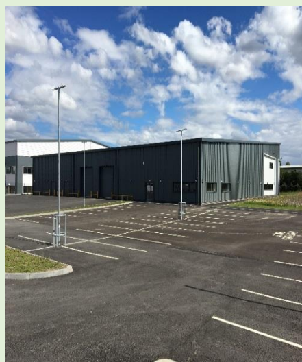
HWW – Plot 10 Eden Horticultural - operational