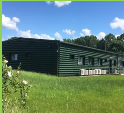
Hortonwood, Plot 6 Veolia – operational (site sold in 17/18)