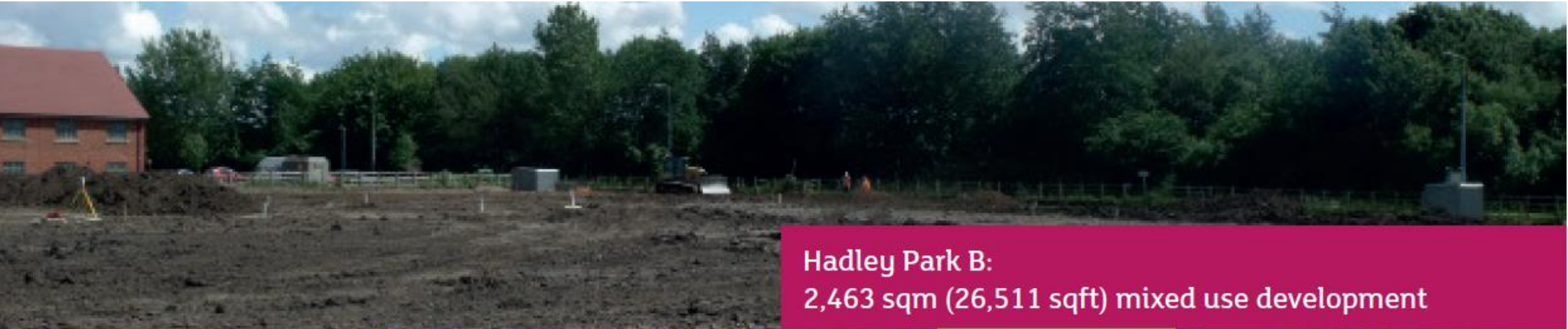
Hadley Park B: 2,463 sqm (26,511 sqft) mixed use development