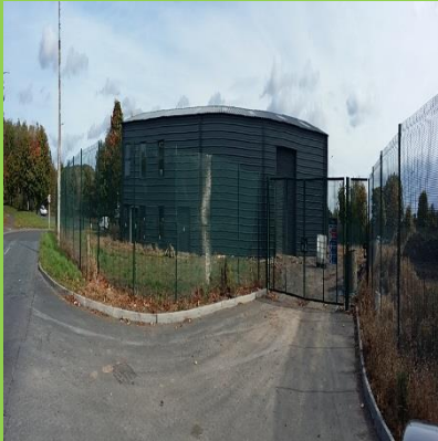
Halesfield 24, Plot 2 Wrekin Pneumatics - operational