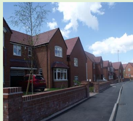
Priorslee E&F – on site Lovell