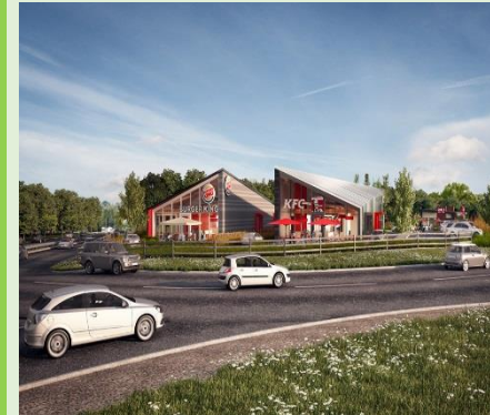
Rampart Way Various – operational