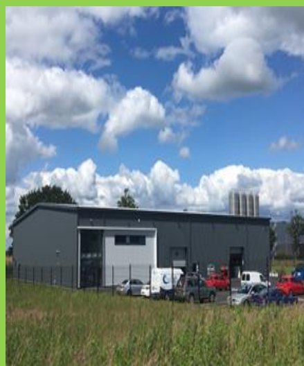
HWW – Plot 6 Baker Bellfield - operational