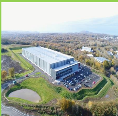
T54 – Plot 6 Magna – Operational