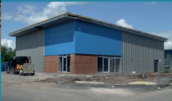
T54, Plot 1c: 373sqm (4,014 sqft) offices, warehouse and trade counter