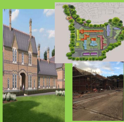
The Beeches – on site Shropshire Homes