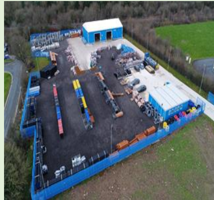
Halesfield 25, Plot A Travis Perkins - operational